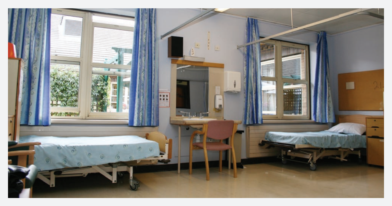
Dormitory at St. Mark's Hospital