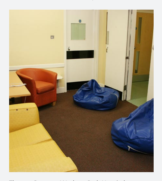
Therapy Room at Wexham Park Hospital