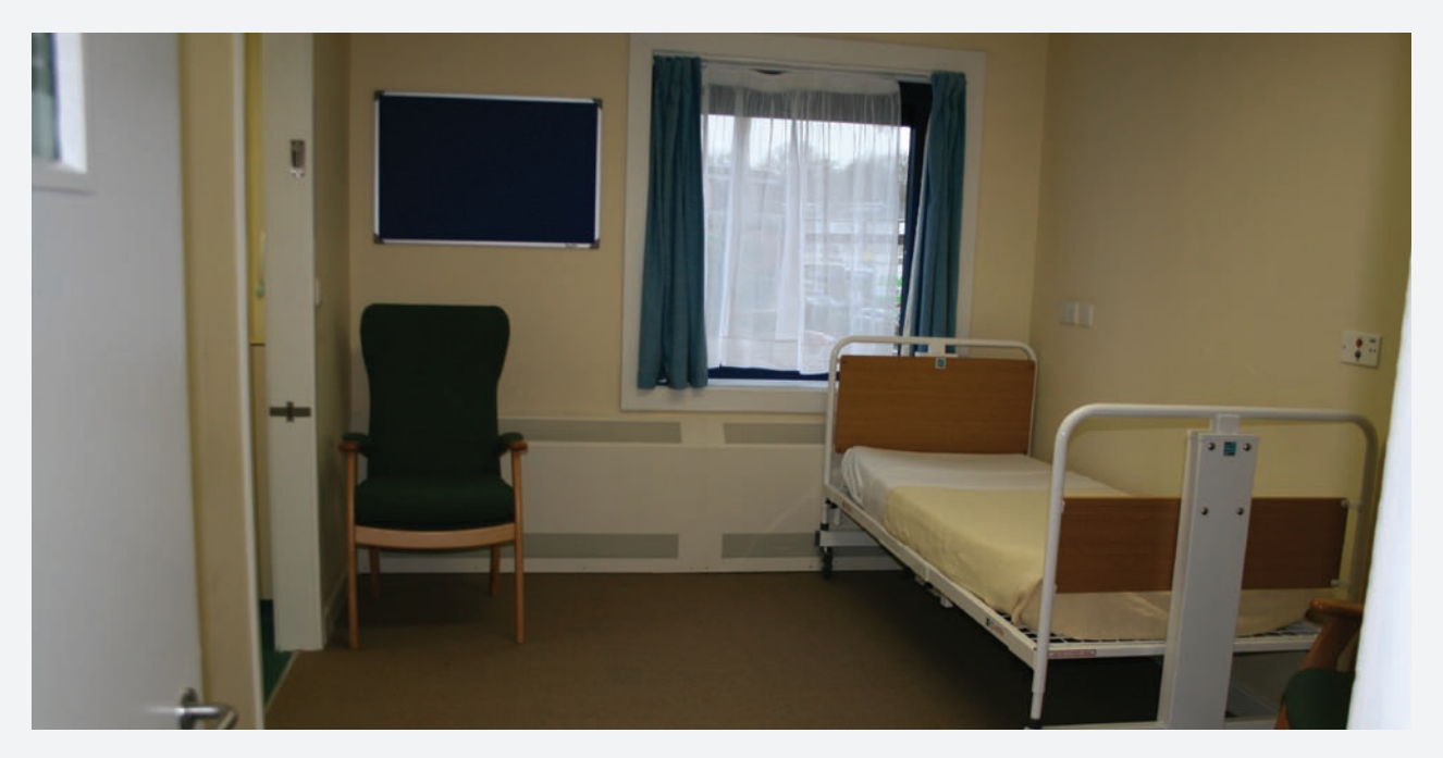
Single Room at Prospect Park Hospital